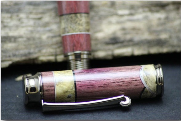
Jason Baldwin: Purple Heart wood accented with Buckeye Burl

Alter-ego: Craftsman/Designer: Flatiron Woodturning